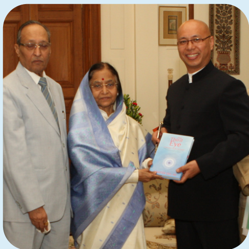
Presentation of The Third Eye book to 12th President of India, Smt. Pratibha Patil and First Gentleman D.R. Shekhawat at Rashtrapati Bhawan. (2010)